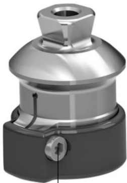
Fig 1. ( E 08s, E 08T )